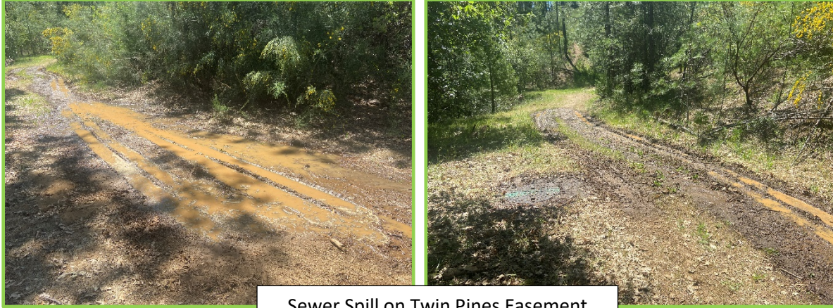
Sewer Spill on Twin Pines Easement