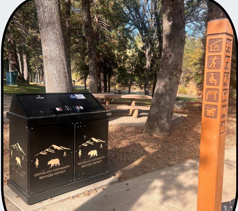
New garbage receptacles throughout the Park