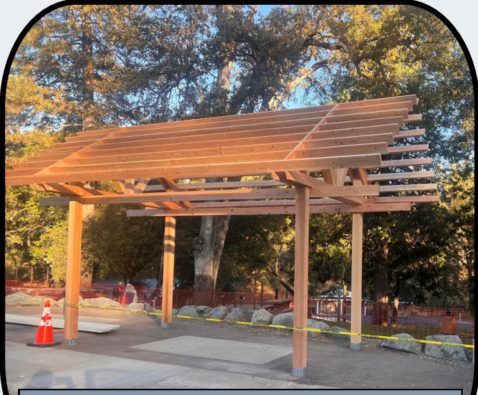
Installation of new bus structure at Mary Laveroni Park