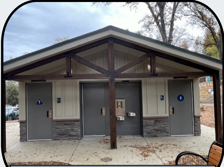
New park bathrooms, installed August 21, 2024