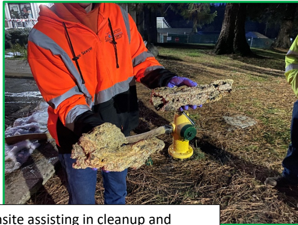
Left: El Dorado had 2 truck onsite assisting in cleanup and pumping out creek Right: grease found in line during hydro flushing/cleaning of main line, this section of main is scheduled to be replaced during the upcoming sewer project