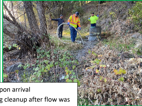
Left: MH spilling upon arrival Right: Staff starting cleanup after flow was stopped