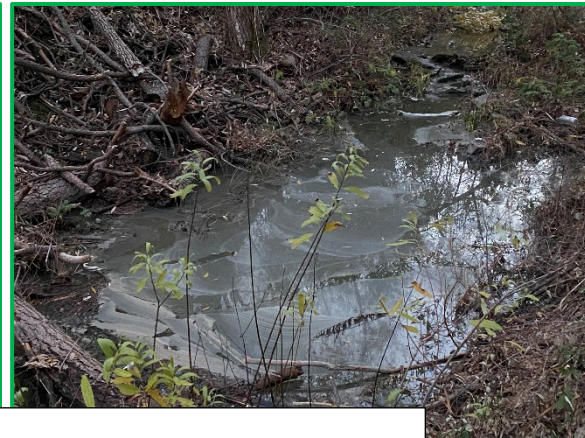
Left: Spill entering Creek Right: Debris/logs damming creek slowing flow, this gave staff a spot to pump out contaminated creek water