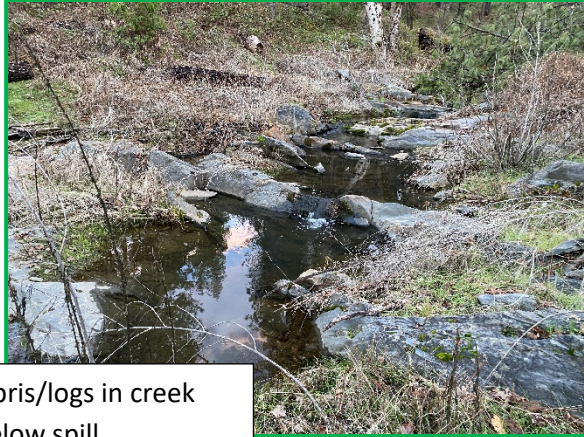
Left: Below debris/logs in creek Right: Creek below spill