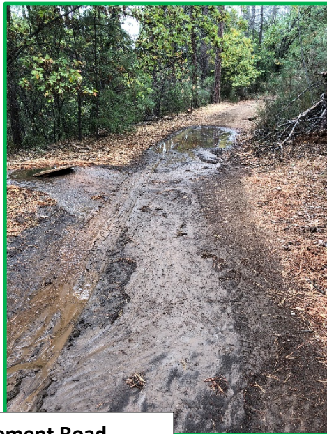
SSO on Twin Pine Easement Road