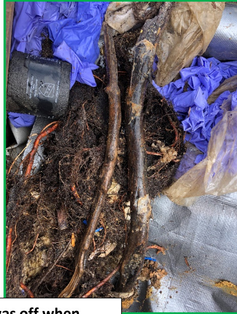
“Left “Manhole Lid was off when Staff arrived, “right”-debris found in manhole causing the backup