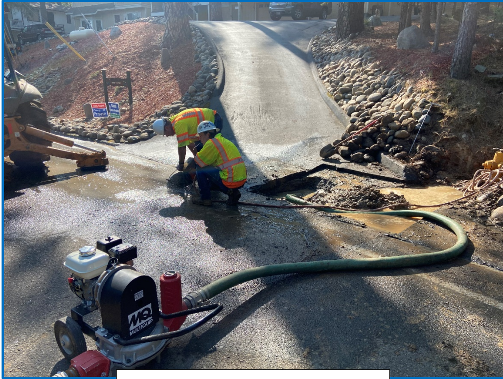
Pine Mountain Drive Service Line Repair