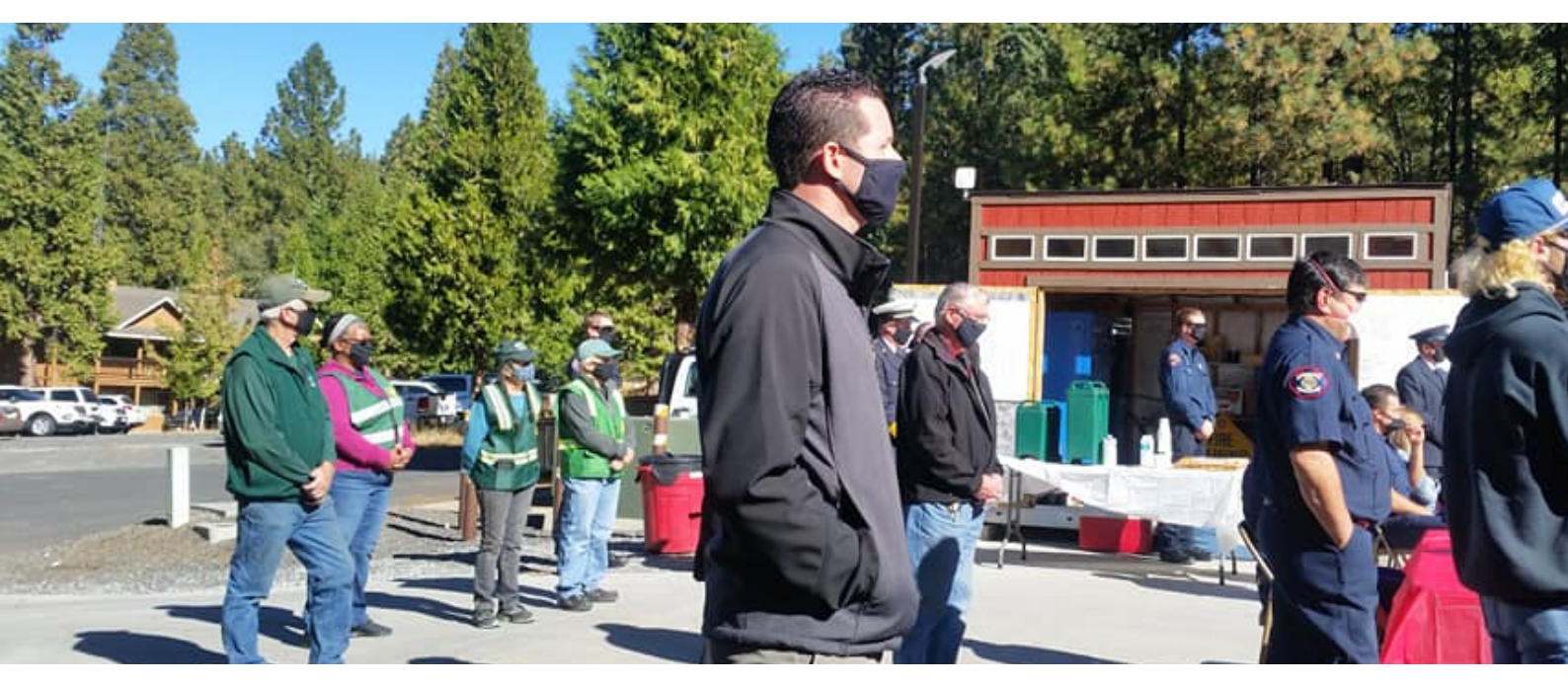
THA-CERT members and representatives of several fire agenciess watch the pinning ceremony