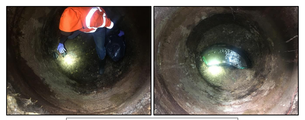
Partially clogged manhole found during inspections

• Cleaned Lift Stations 1, 3, 4 and 16 (wet wells, Pt's, floats)