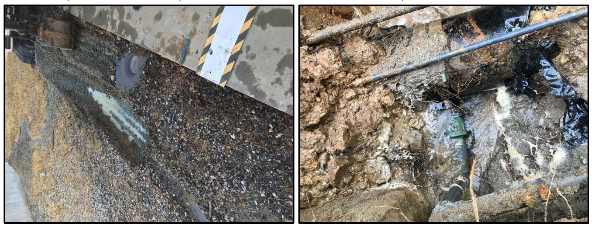
2G sample line leak at corporation stop