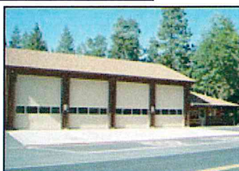
Fire Station 1