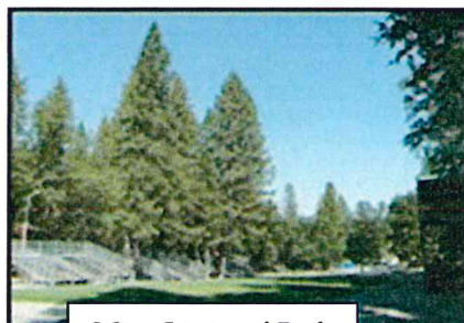
Mary Laveroni Park