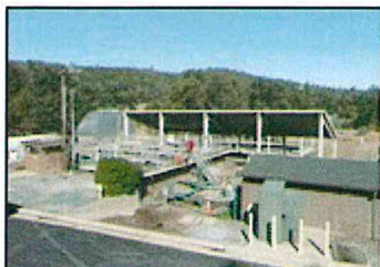
Wastewater Treatment Plant