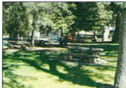
Park- Upper level

GCSD owns and operates Mary Laveroni Community Park, the Groveland Skate Park, the Groveland Basketball Court, and the Groveland Dog Park. Mary Laveroni Community Park is also home to the Tuolumne County owned Groveland Youth Center.